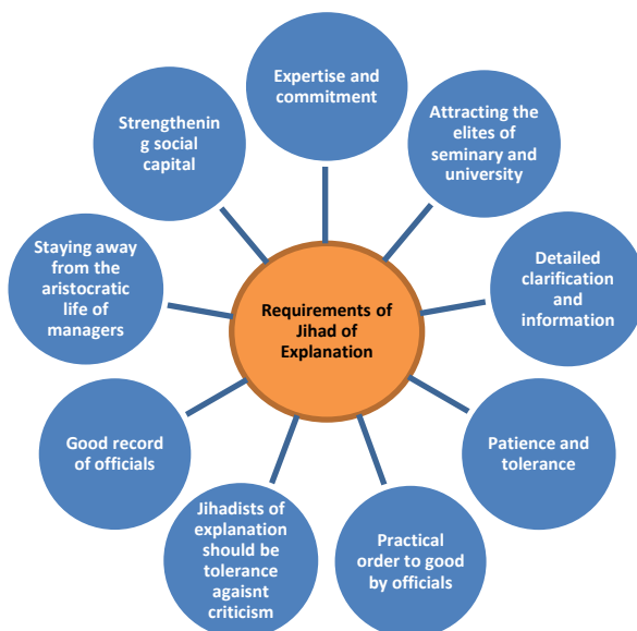
Diagram number 3: The requirements of jihad of explanation

which should be done by Jihadists in this field. They should implement those requirements so that they can, as a real warrior and a jihadist, engage in the jihad of explanation and defend the mind, spirit, and soul of society against the soft attack storms of the sworn enemies of Islam and the revolution. The division below can be implemented within all 4 general policies mentioned above, but it should be noted that since the explanation is a dynamic thing that is constantly being renewed and with new events that happen in society, these requirements are constantly changed and there is a possibility of increasing or decreasing them.